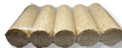
Briquettes in shrink wrap