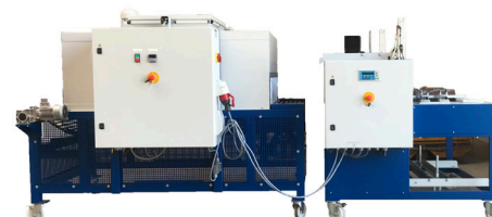
Semi-automatic packaging line