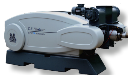
The C.F. Nielsen BP6510

The briquetting line is suited for many kinds of raw material but operates best with clean homogenous softwood or hardwood with an ash content below 0.5%. The moisture level has to be 8-12% and particle size up to 15x3x2 mm.